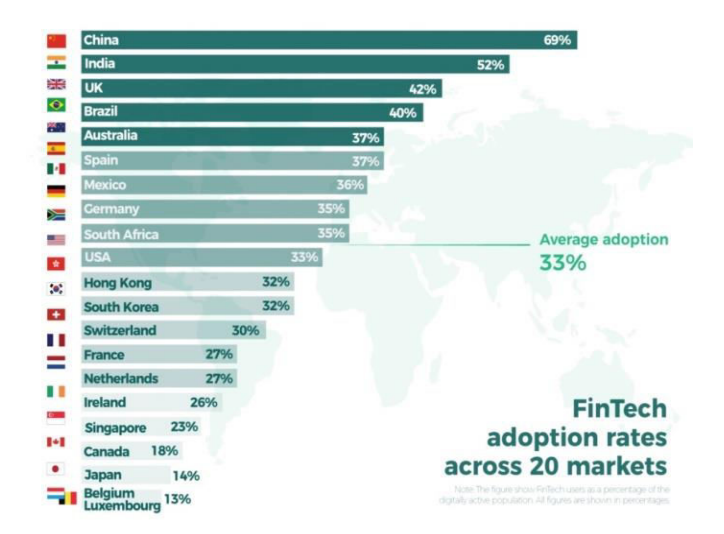
Fig -2: FinTech adoption rates

The way mobile phones have changed behavior of consumer and how people use the internet is also one of the reason why they differentiate between the developed and developing countries. As of today, the countries with the highest financial technology usage are China (69%) and India (52%). China, India and other emerging markets never had time to develop Western levels of physical left banking infrastructure, which has more hospitable to new solutions. In China, the FinTech penetration is well above the average global adoption (33%) also that of the average adoption across emerging markets (46%).